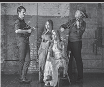
Mark O'Connor Band