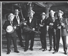
Earls of Leicester