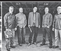
Lonesome River Band